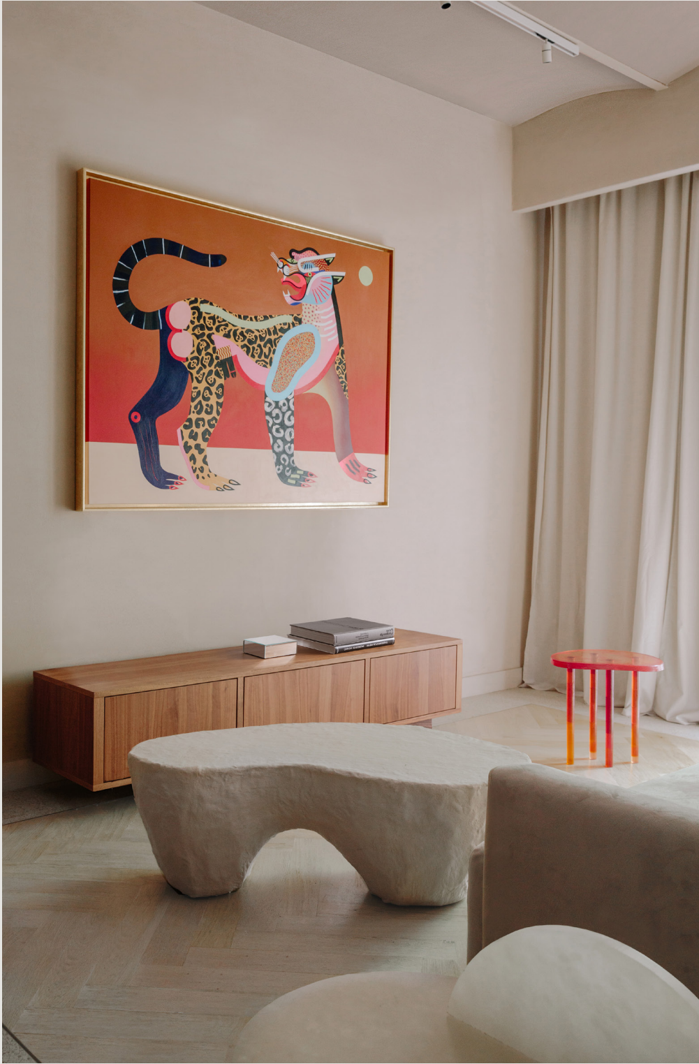
Table 2.0 ref.200502