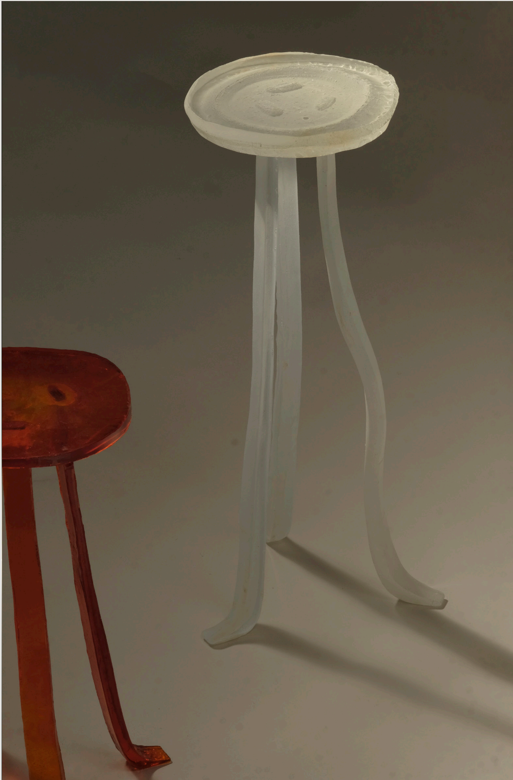
The lung tables 3.0 ref.230203