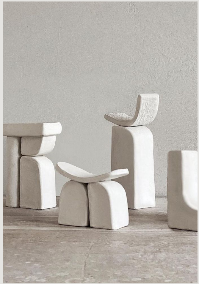
Table 3.0 ref.220503