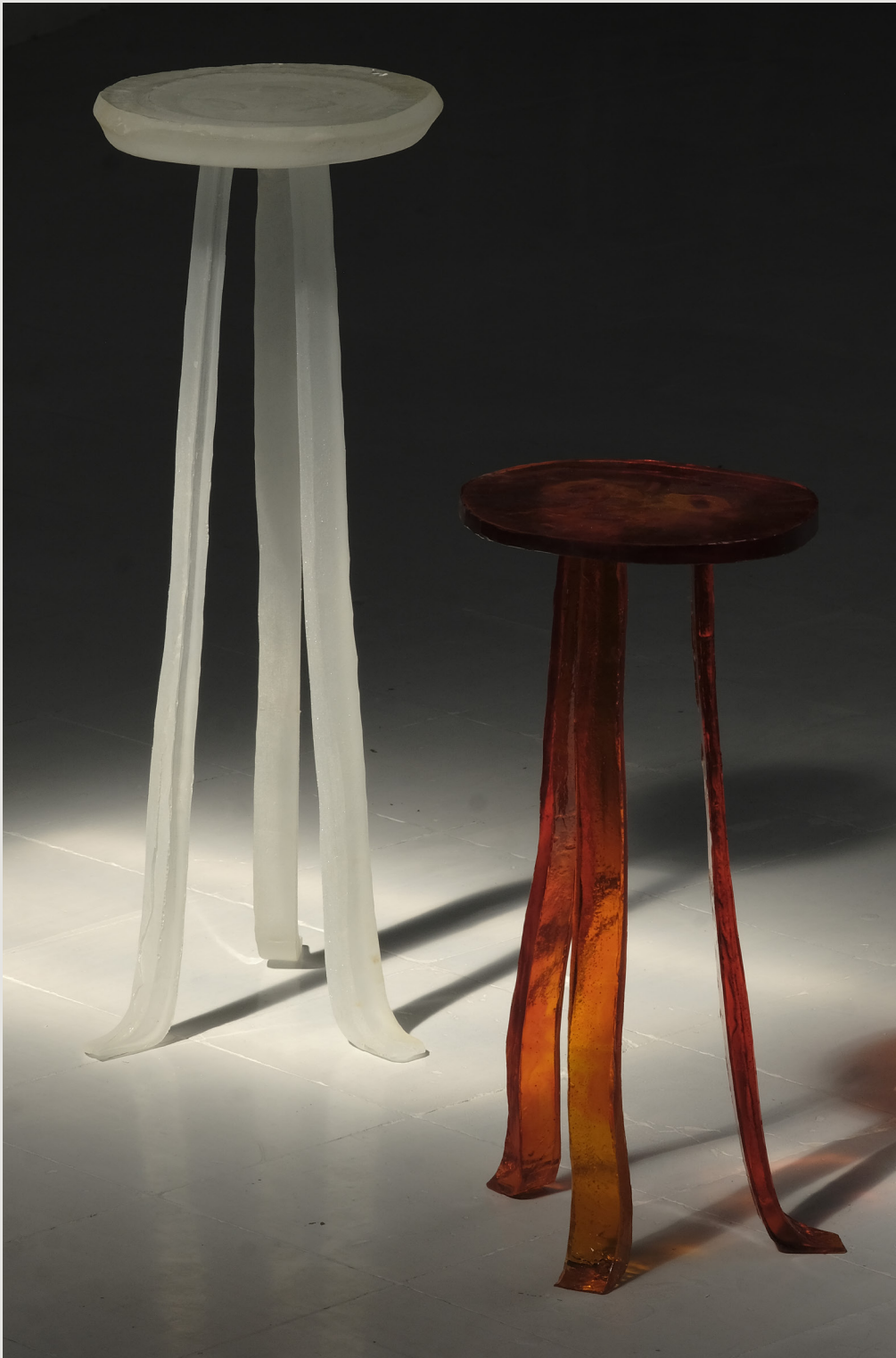
The lung tables 3.0/1.0 ref.230203