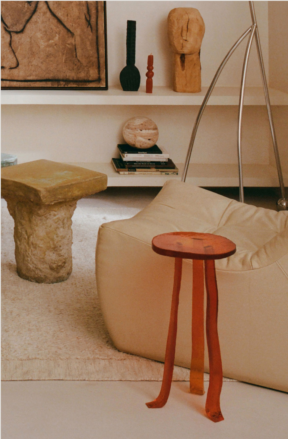
The lung table 1.0 ref.230201