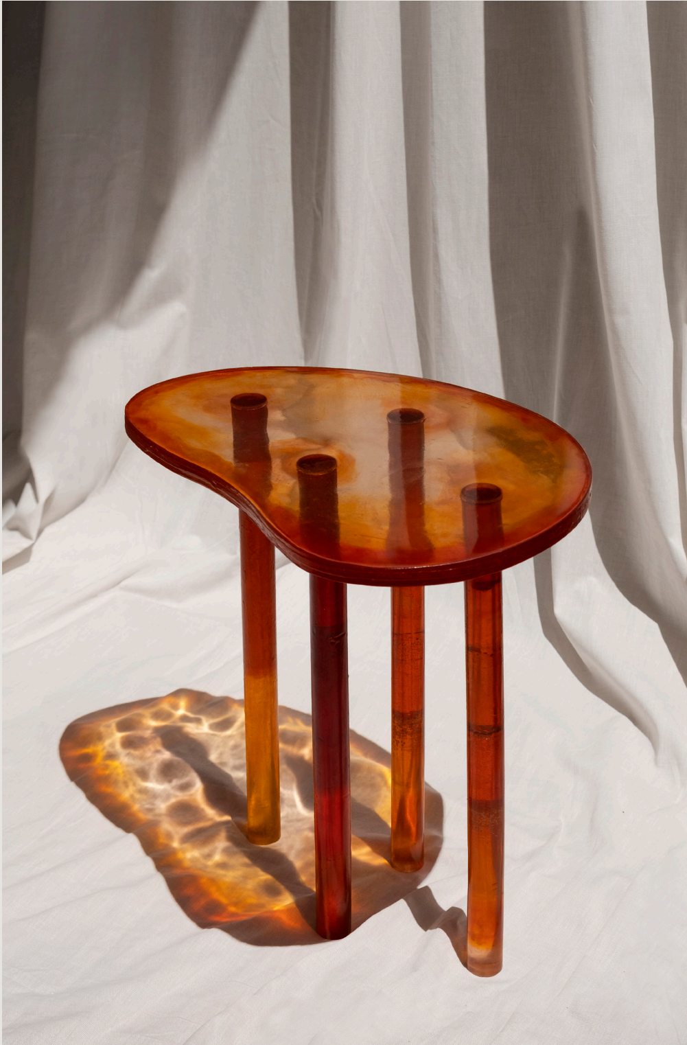
The lung table 2.0 ref.240202