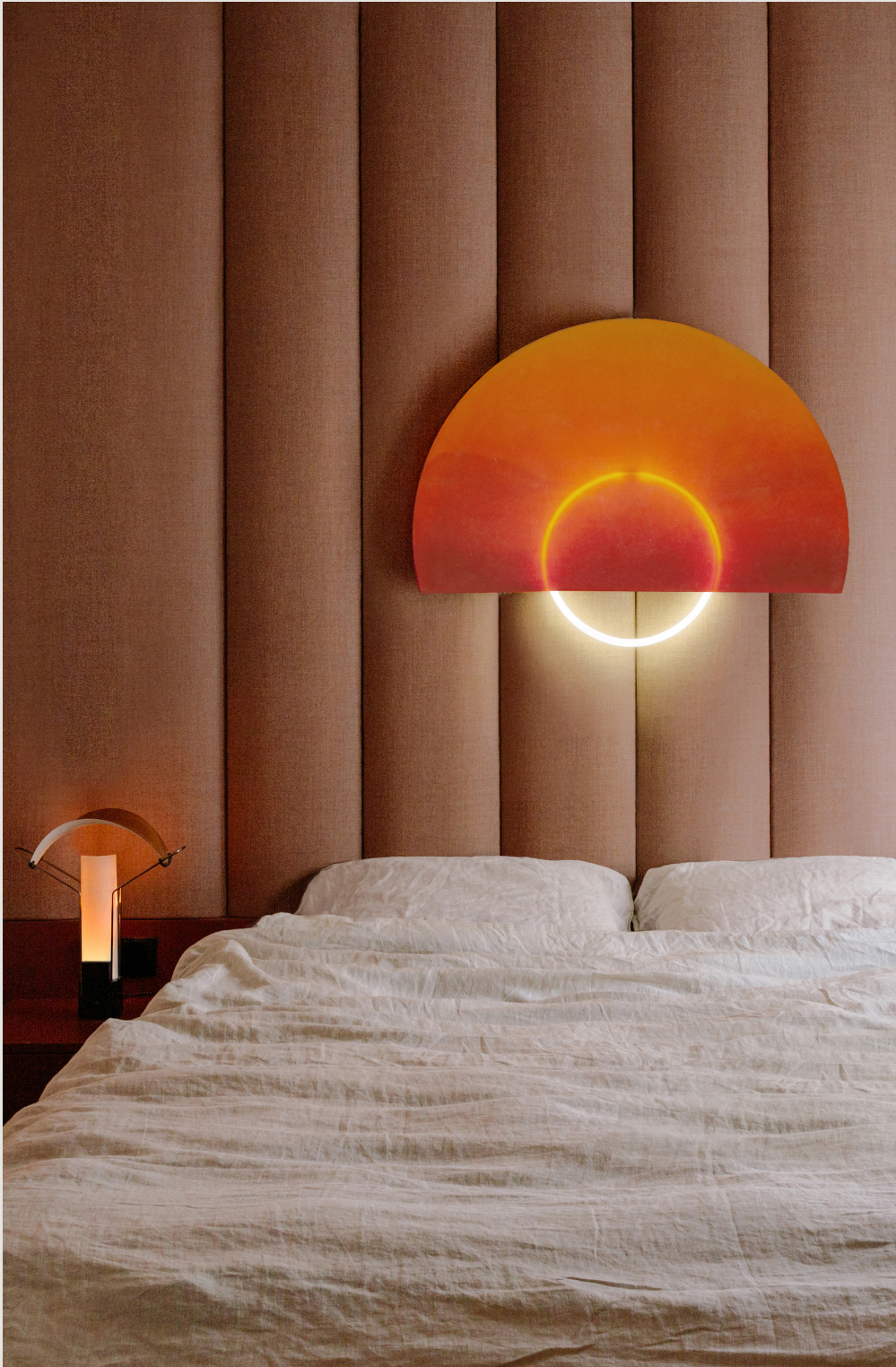
The sunburst scone 1.0 ref.210201