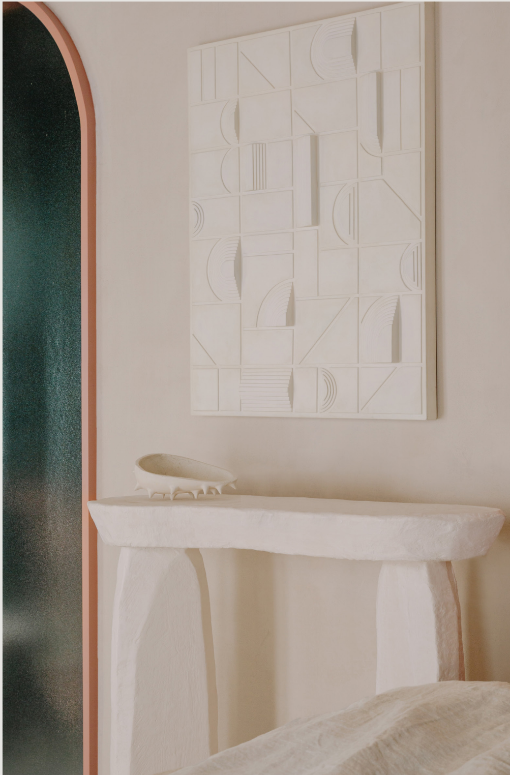
Console 2.0 ref.210502