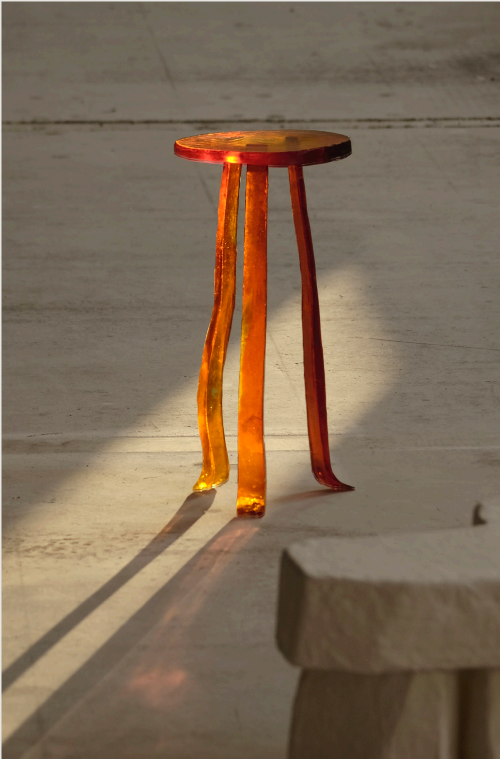
The lung table 1.0 ref.230201