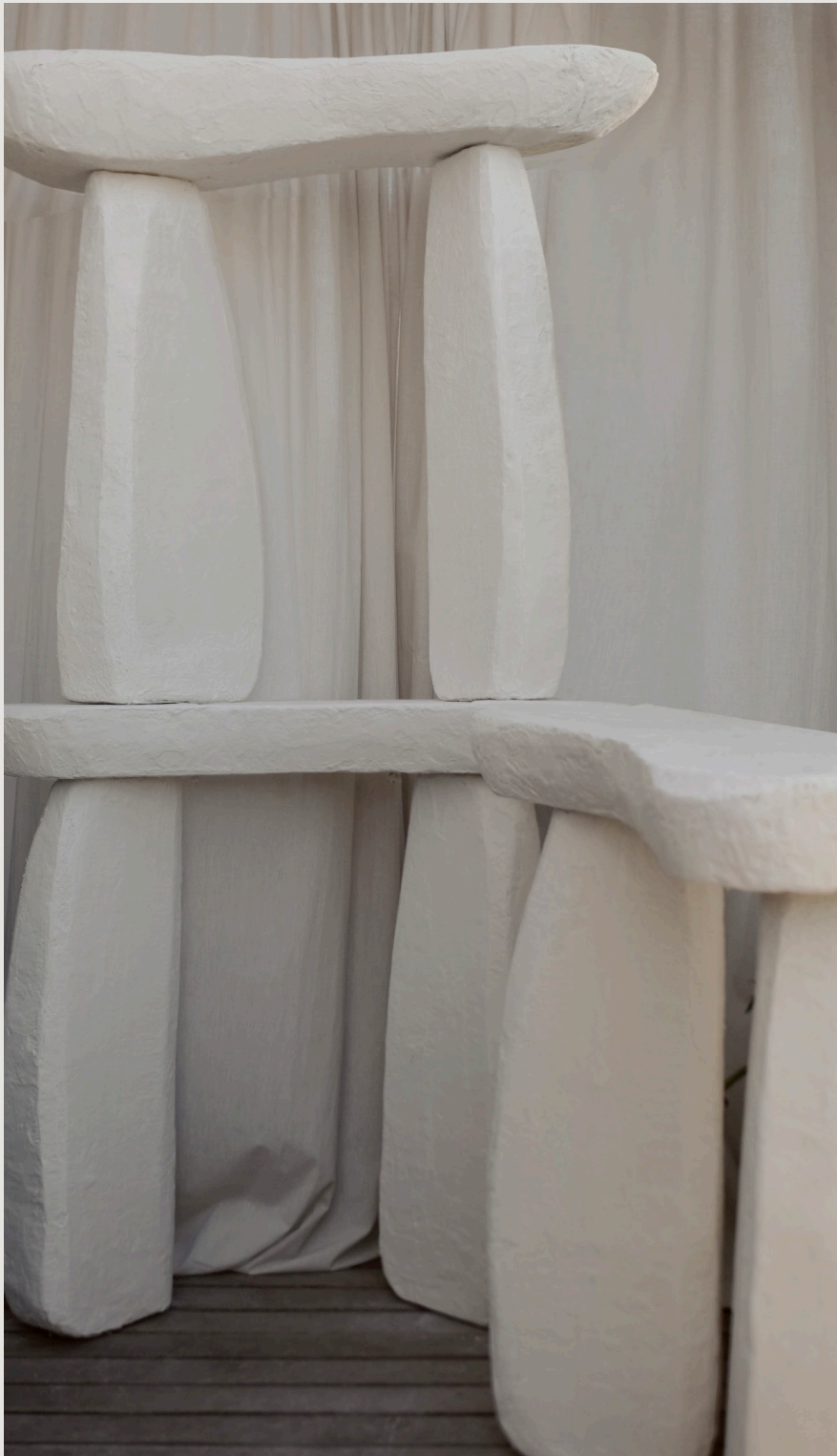
Console 2.0 ref.210502